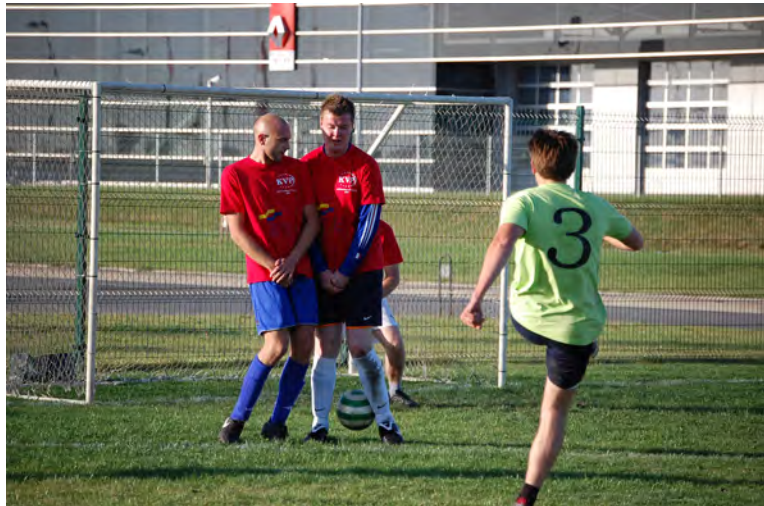
Always wear protection :)