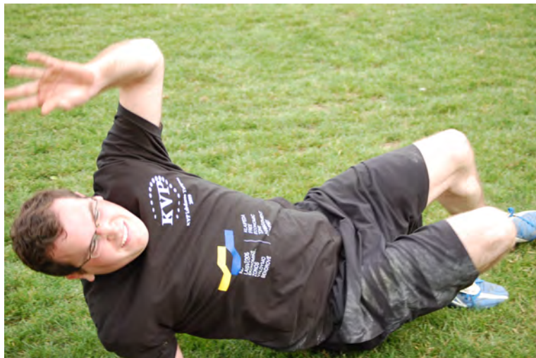
Gymnastics? Breakdancing? Falling?