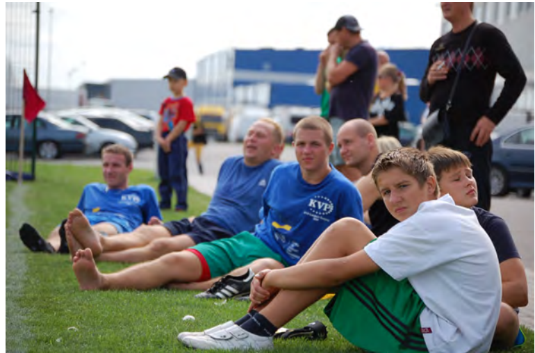
FEZ-Argus putting their feet up...