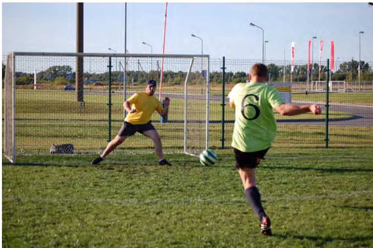
Time stands still...