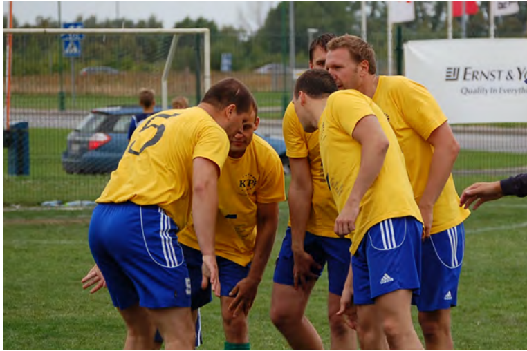
DFDS Lisco talking about big business...