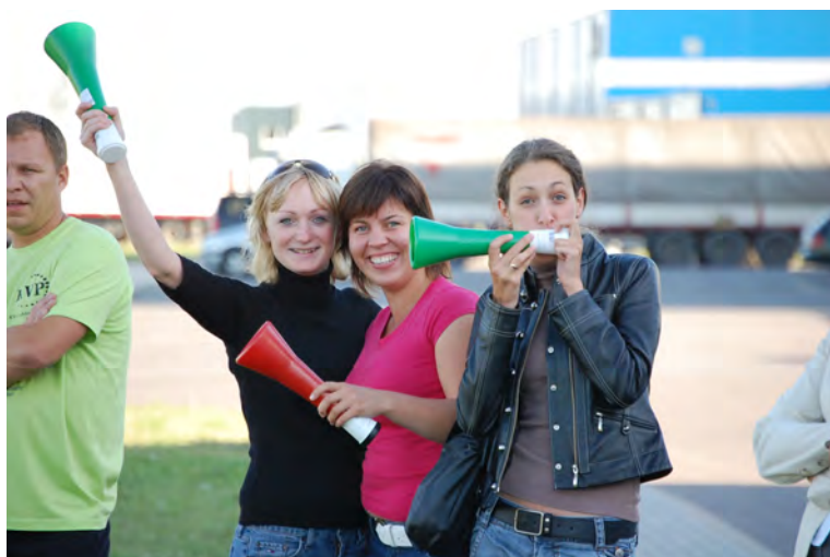
The lovely ladies from Mestilla...