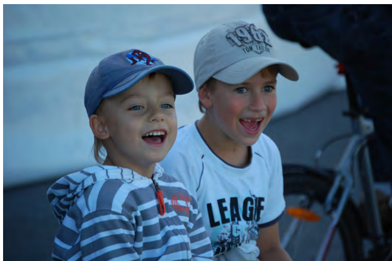
Einam, Einam, Einam....