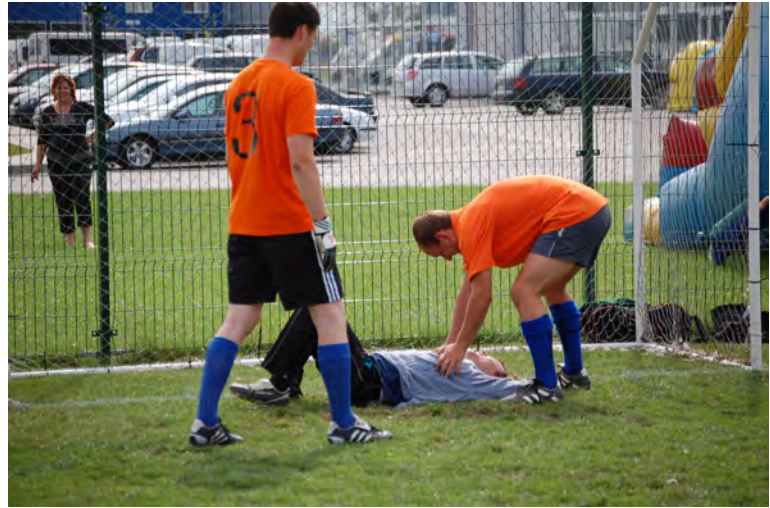
Who's got the tickles?...