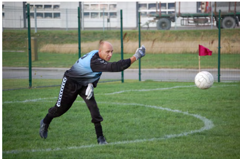
Bowling for a strike!