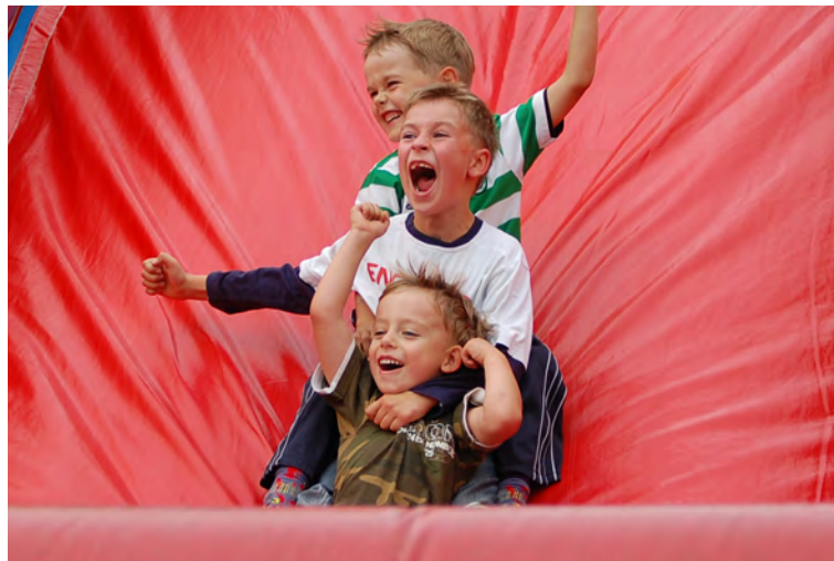
VERY excited berniuikai!!!