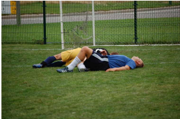
Good night! Sweet Dreams! :)