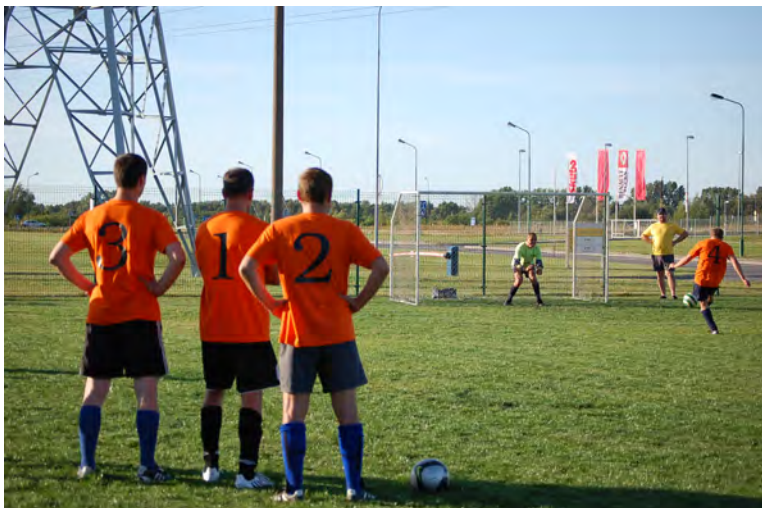
A tense moment for Onninen/Admen...