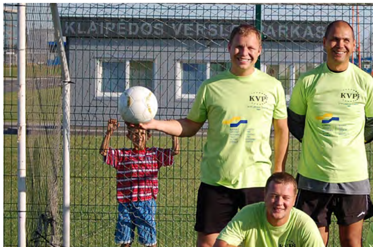
Me me me, I want to be in the picture too!