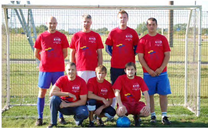
ORION GLOBAL PET