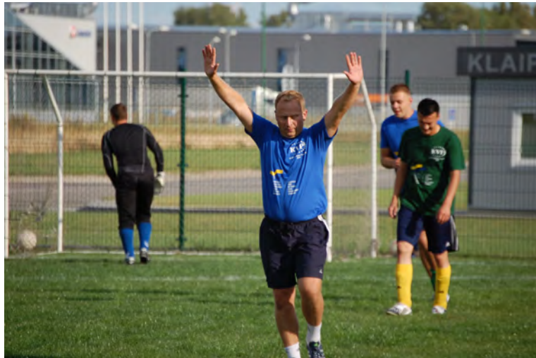
I know, I know. Thank you, Thank you!