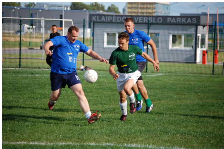
Mine, mine, mine!!!