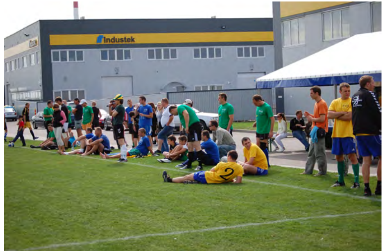
Supporters look on...