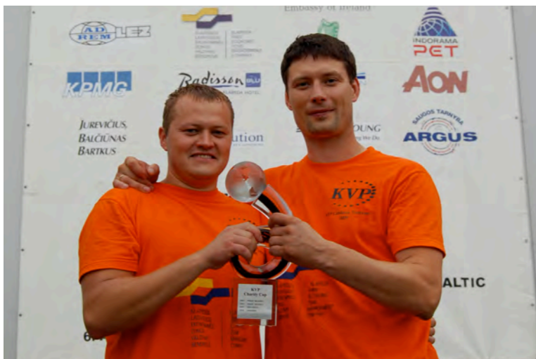
Best Friends Forever ♥♥♥