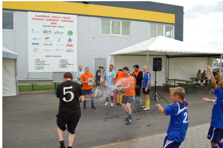
Where's the fire?...