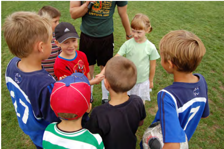
Children from Klaipeda TB Hospital join in the fun and games. Girls can play football too!